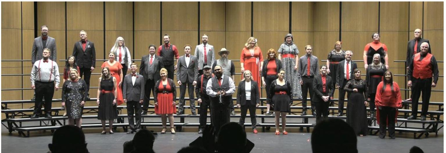
PDX VOICES—2023 EVERGREEN DISTRICT CHORUS CHAMPIONS

All Voice ensembles at this year's International included 3rd place chorus Gotham, our own PDX Voices, and 9th place quartet Smoke Ring.