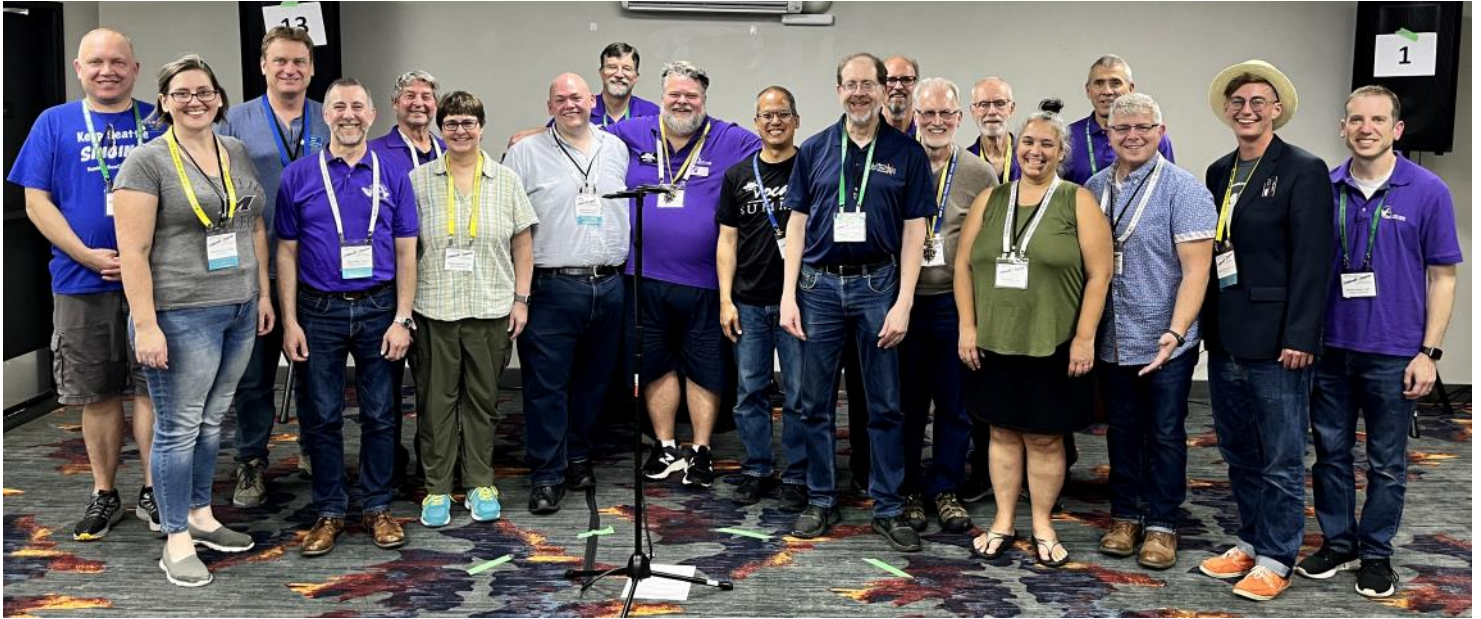
2023 Harmony Platoon 'first time' participants (above); Harmony Platoon Chorus of all participants (below)