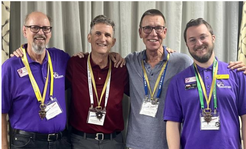
2023 Platoon Quartet Champs