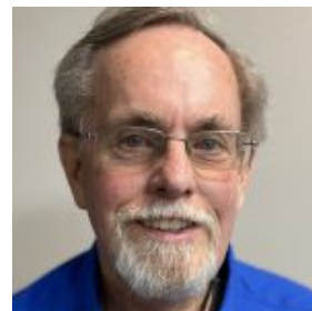
Greg Kronlund Communications