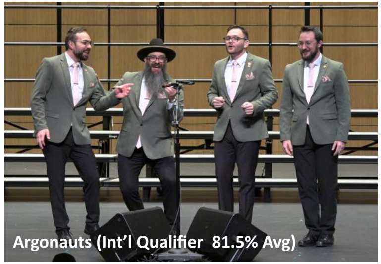
Argonauts (Int'l Qualifier 81.5% Avg)