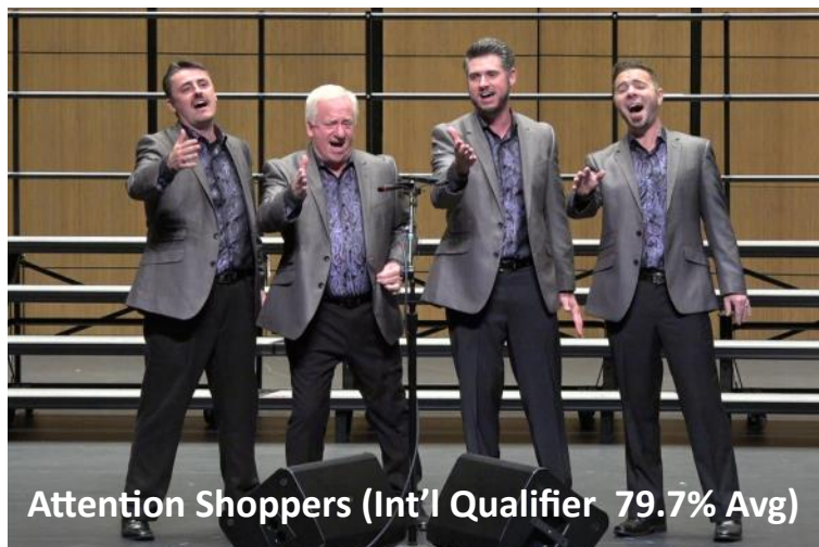
Attention Shoppers (Int'l Qualifier 79.7% Avg)