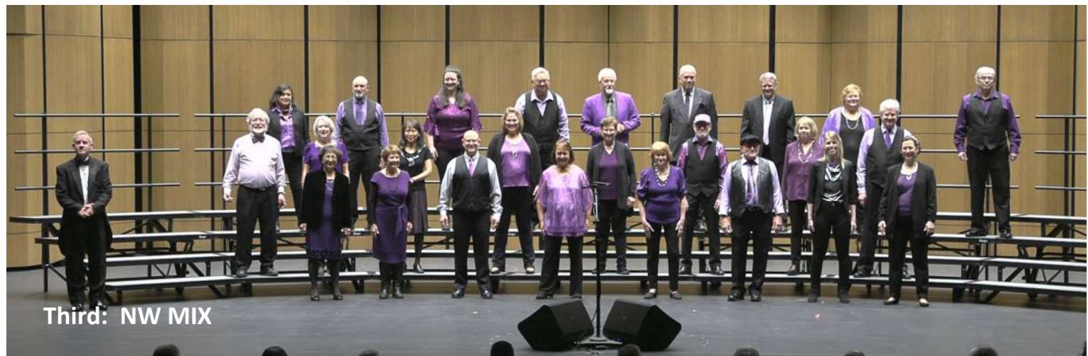
Third: NW MIX