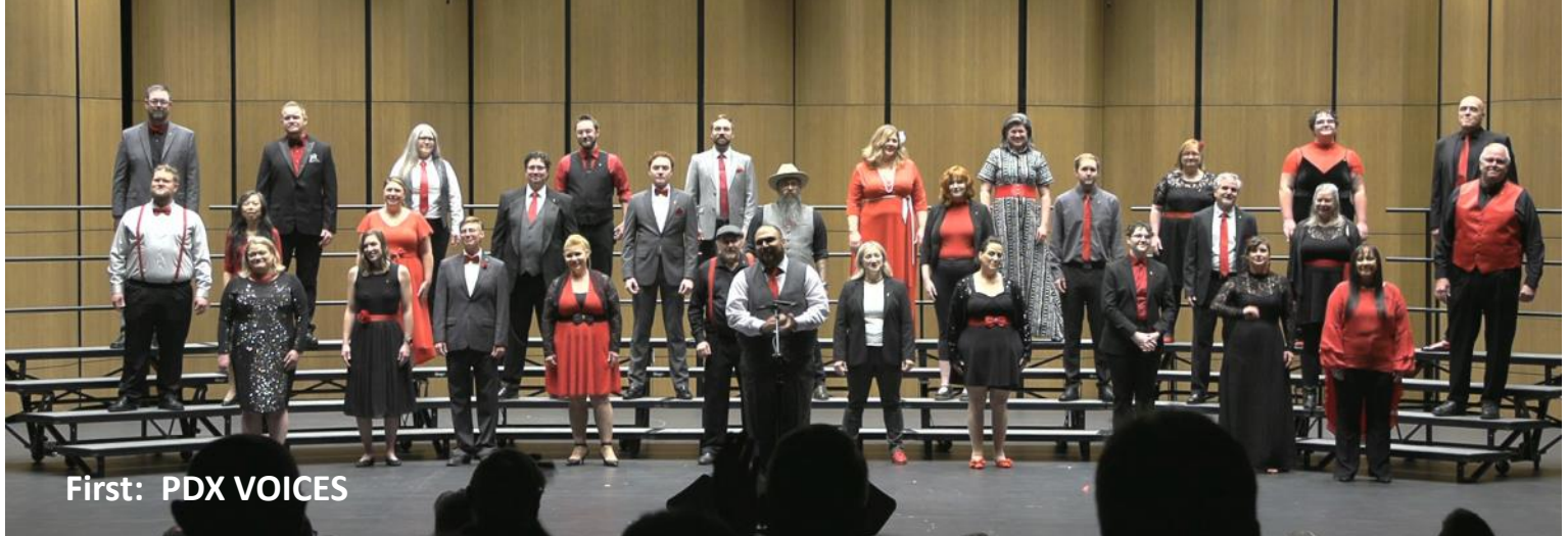
First: PDX VOICES

Another District Convention and Contest is in the books, and WHAT A CONVENTION IT WAS!!! 37 Quartets and 20+ choruses performing and a thoroughly entertaining weekend of terrific barbershop harmony. Many thanks to the Federal Way and District Team organizers, the volunteers, judges and others who made this happen. And to top it off, 5 quartets qualified for International in 2024, a historic and truly wonderful feat! (continued next page)