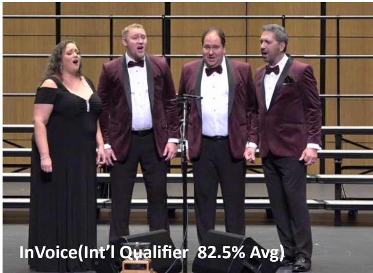
InVoice(Int'l Qualifier 82.5% Avg)