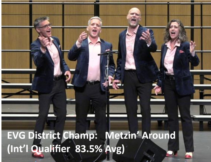
EVG District Champ: Metzin' Around (Int'l Qualifier 83.5% Avg)