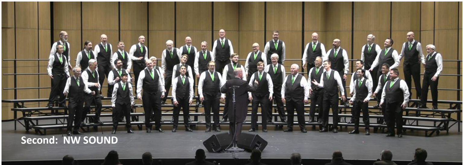
Second: NW SOUND