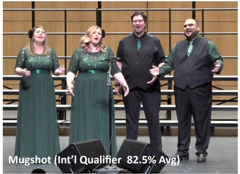
Mugshot (Int'l Qualifier 82.5% Avg)