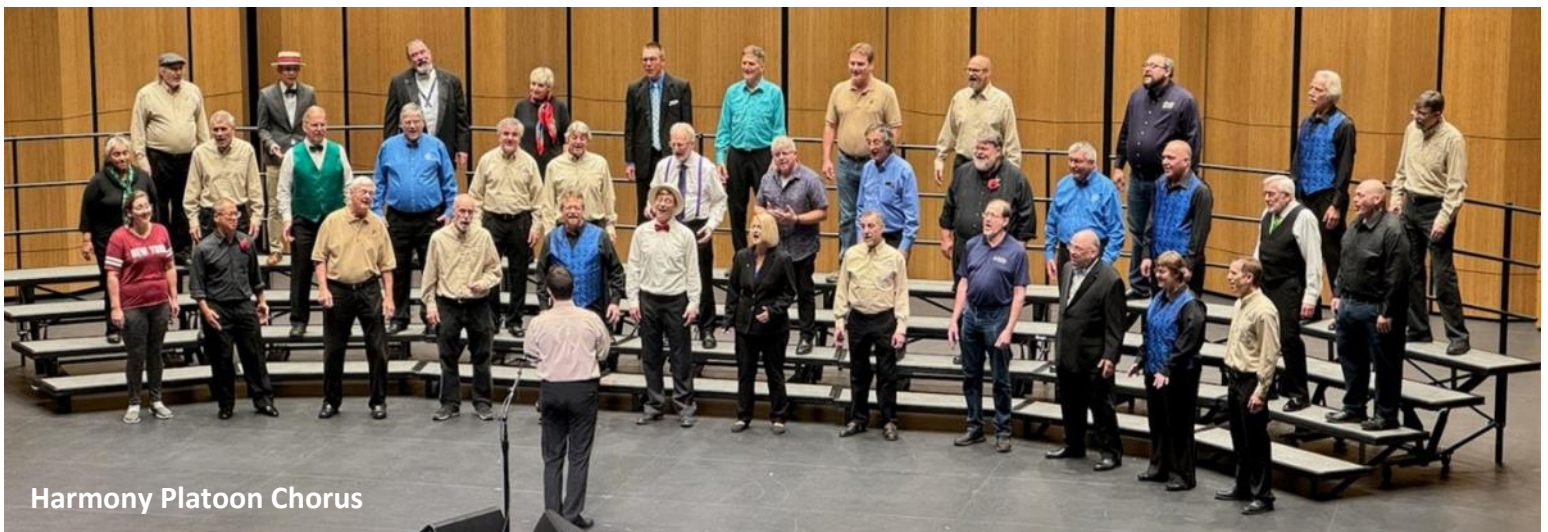
Harmony Platoon Chorus