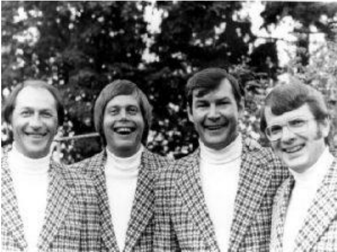
The Bright Side 1974