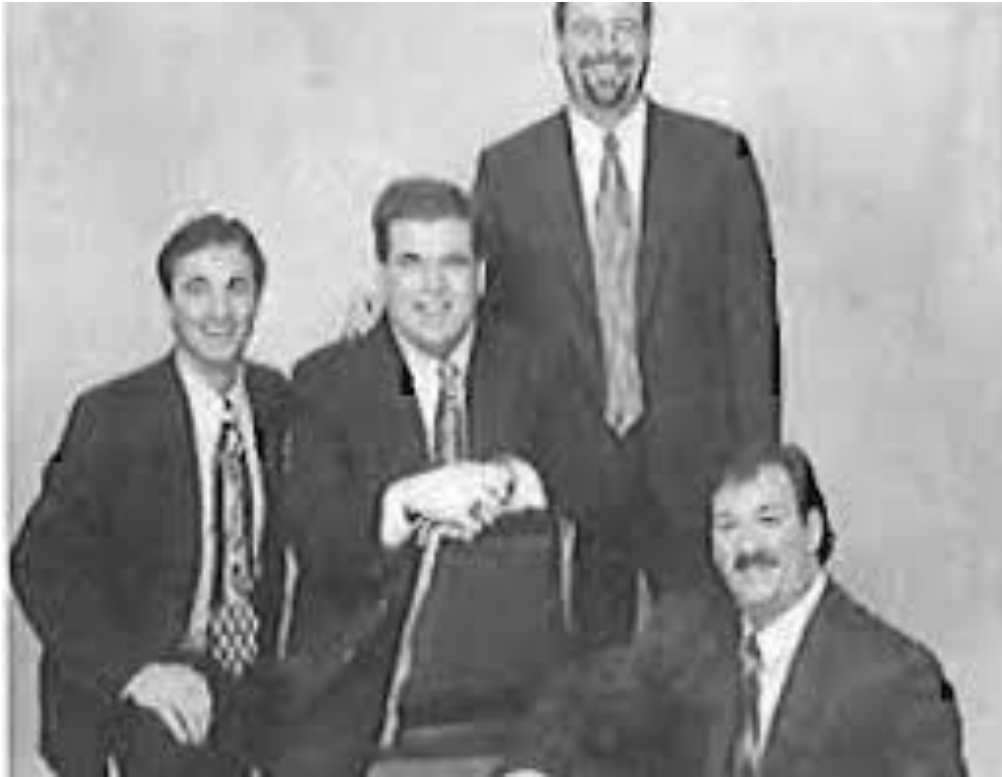
Studio One 1998