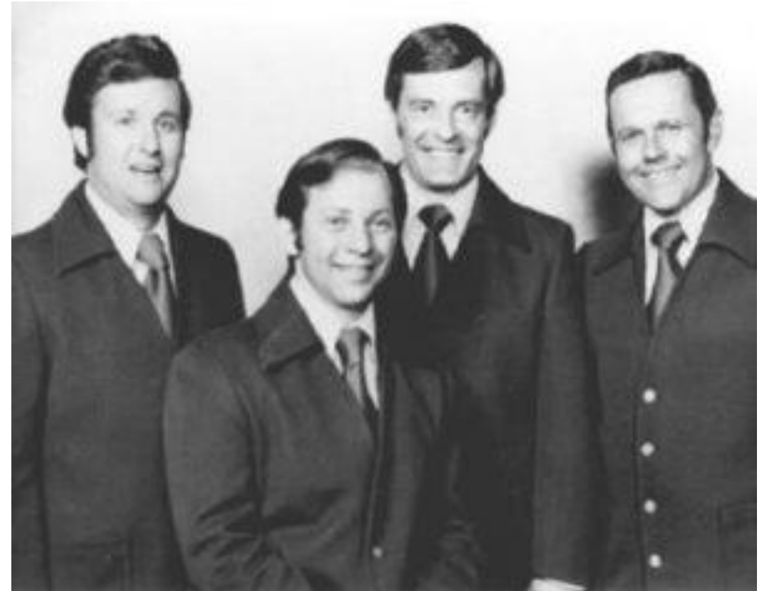
New Found Four 1973