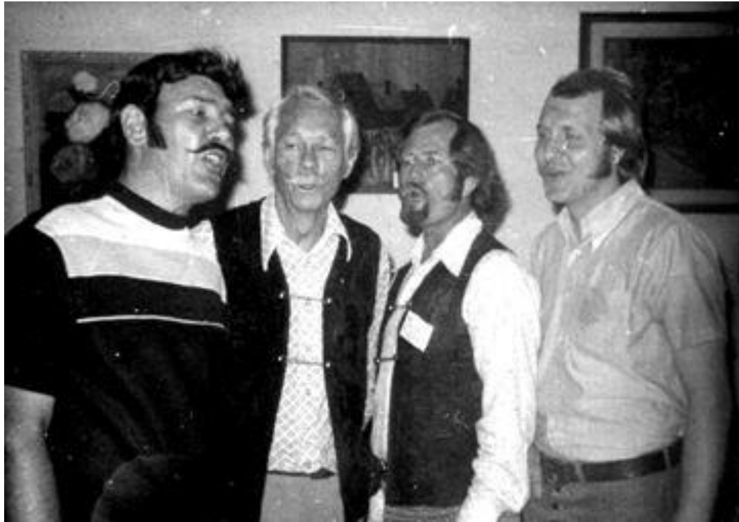
Most Happy Fellows 1971