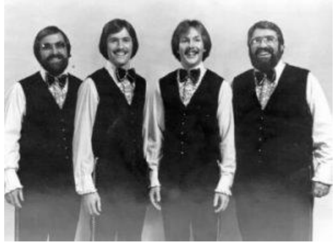
High Rollers 1981