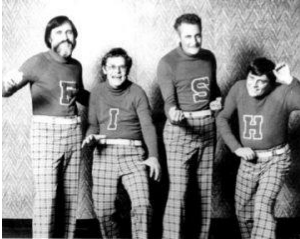
Commencement Bay Flounders & Seafood Conspiracy - 1976