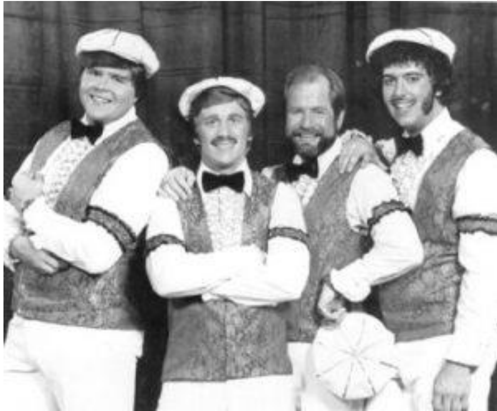
South Sounders 1980