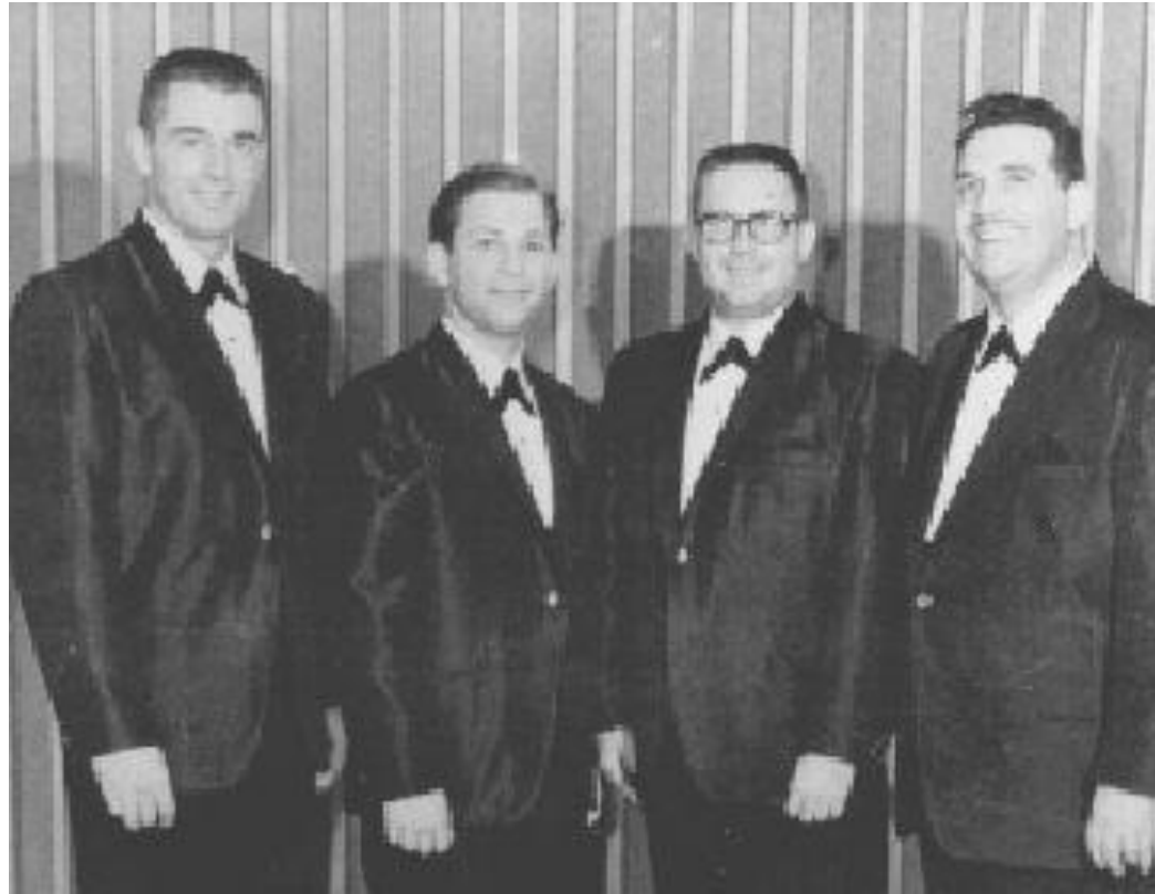
Squires Four 1965