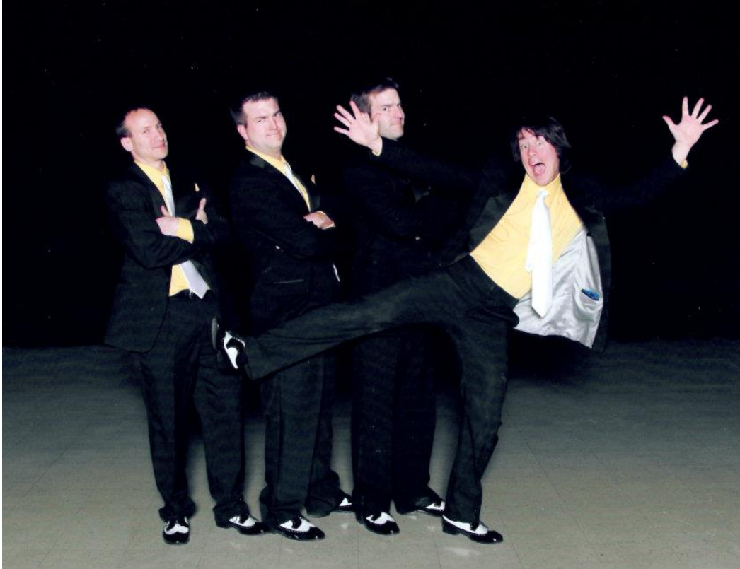
New Originals 2010