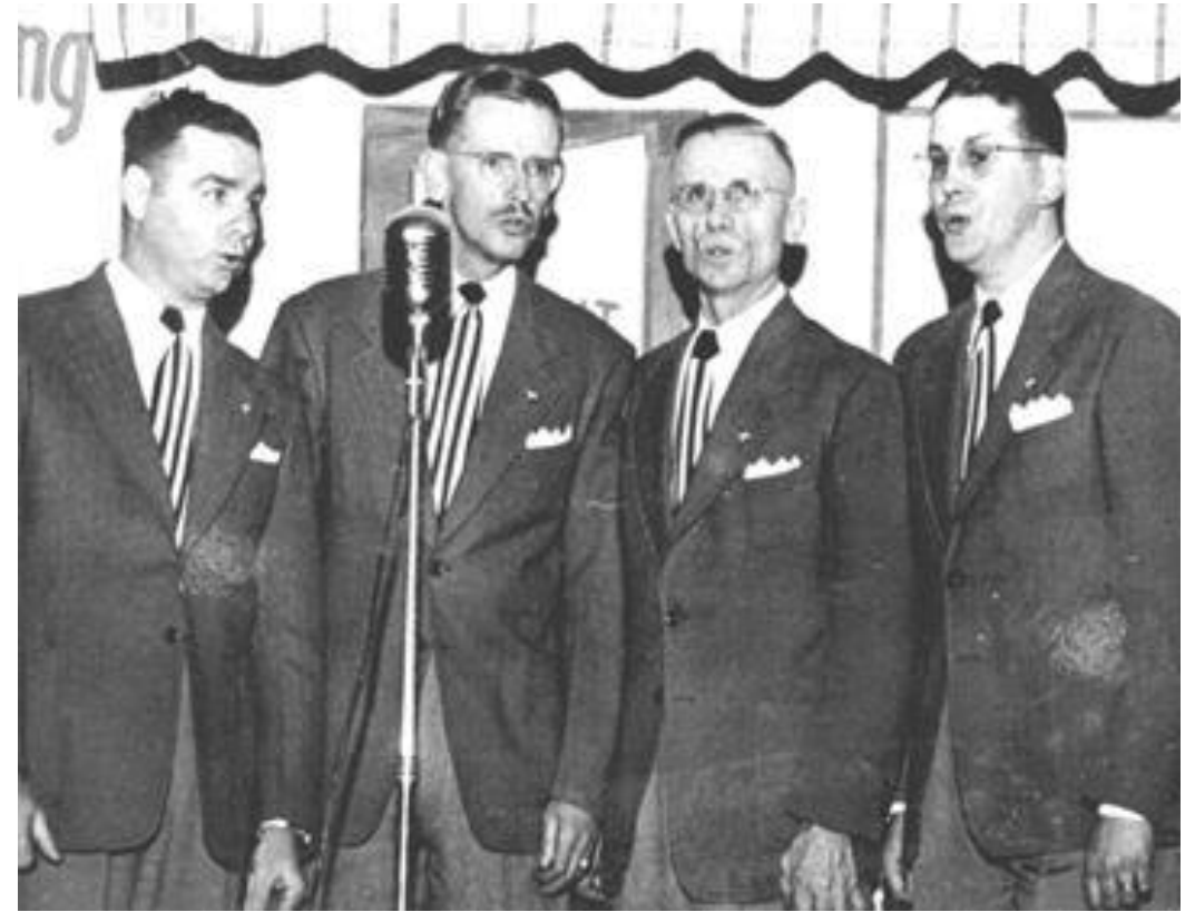
Queen City Four 1949