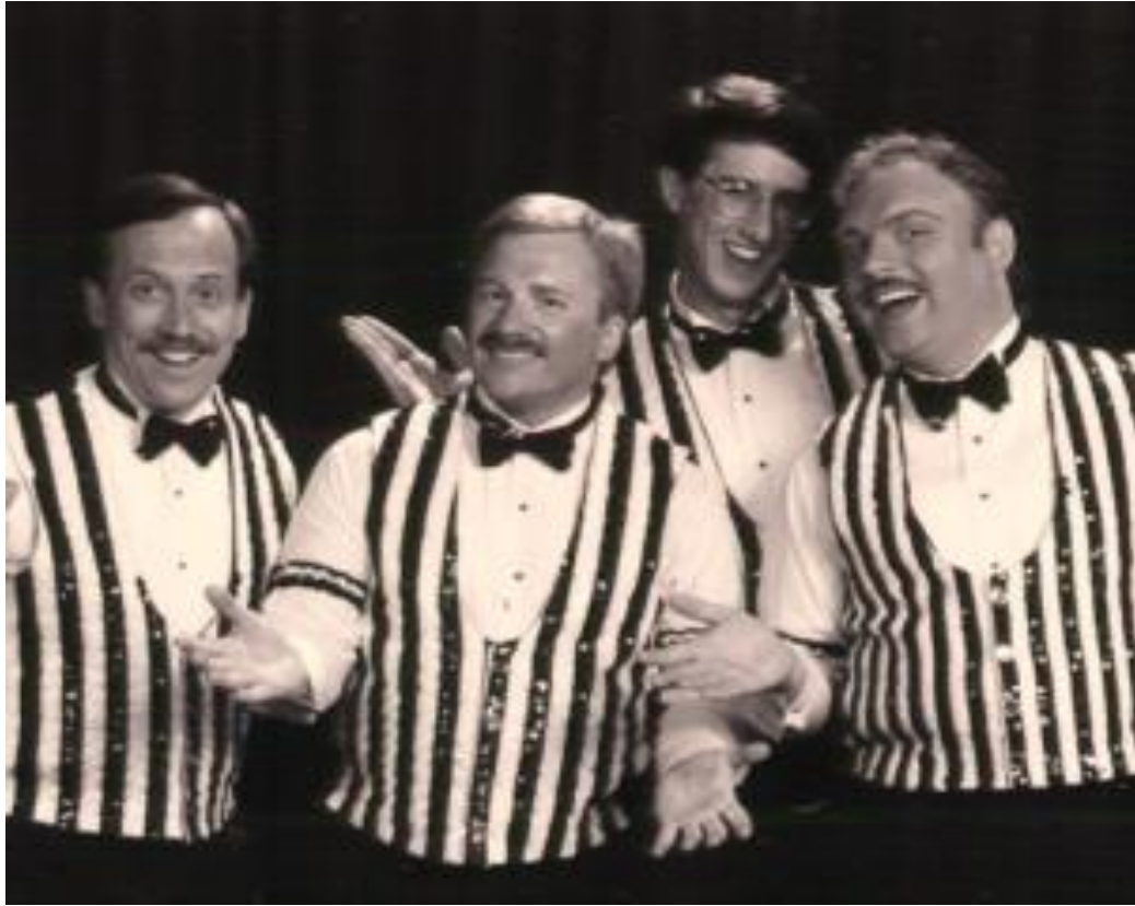
Seattle Sound 1992