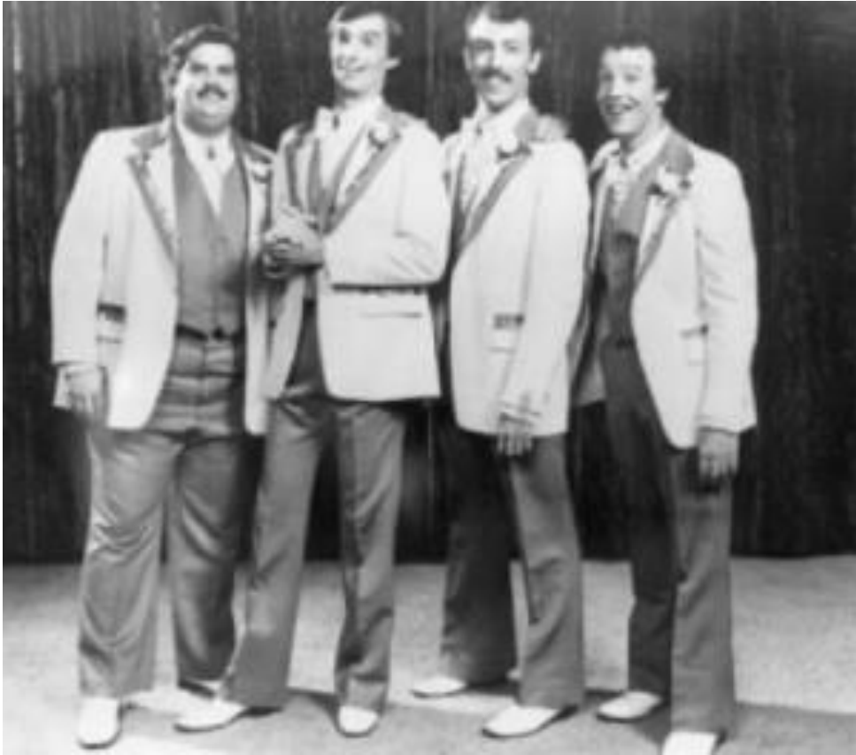
Harmonic Tremors 1984