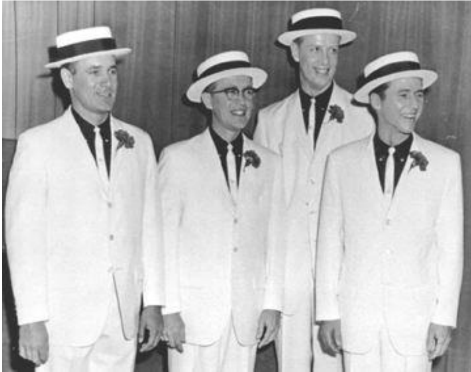
Roaring 24 1963