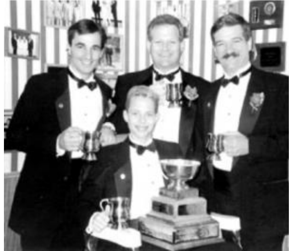
Milky Way 1993