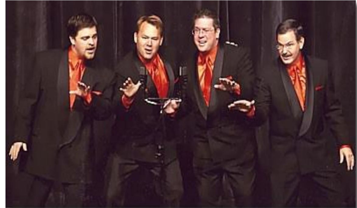
Vocal Magic 2005