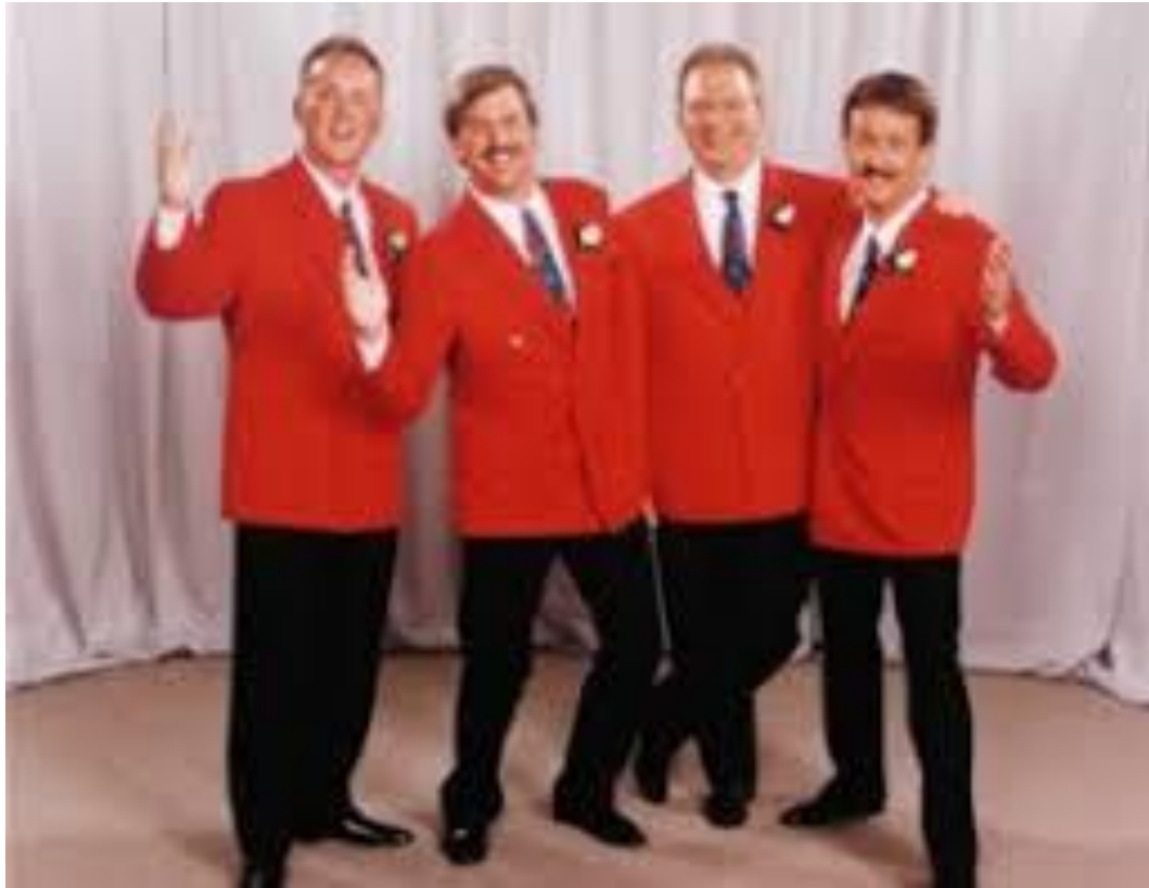
Critics' Choice 1996