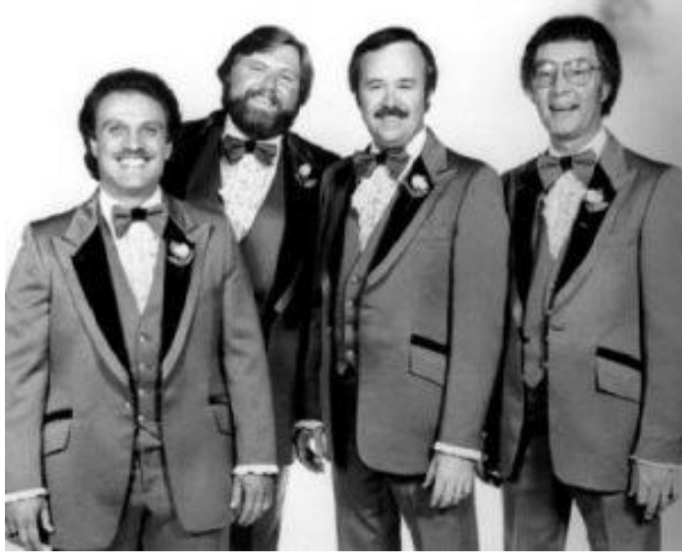
Cascade Connection 1982