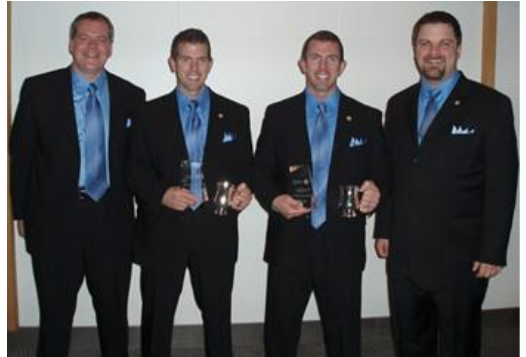
Jet Set 2007