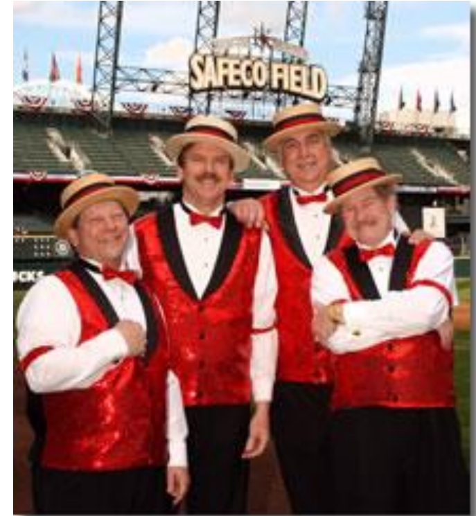
Friendly Advice 2003