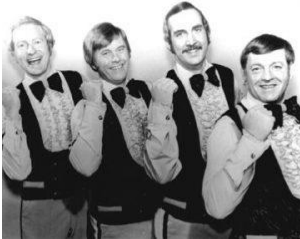
New Rendition 1978