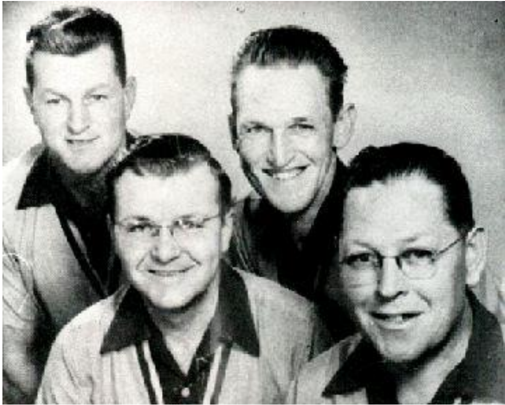
Evergreen Four 1952