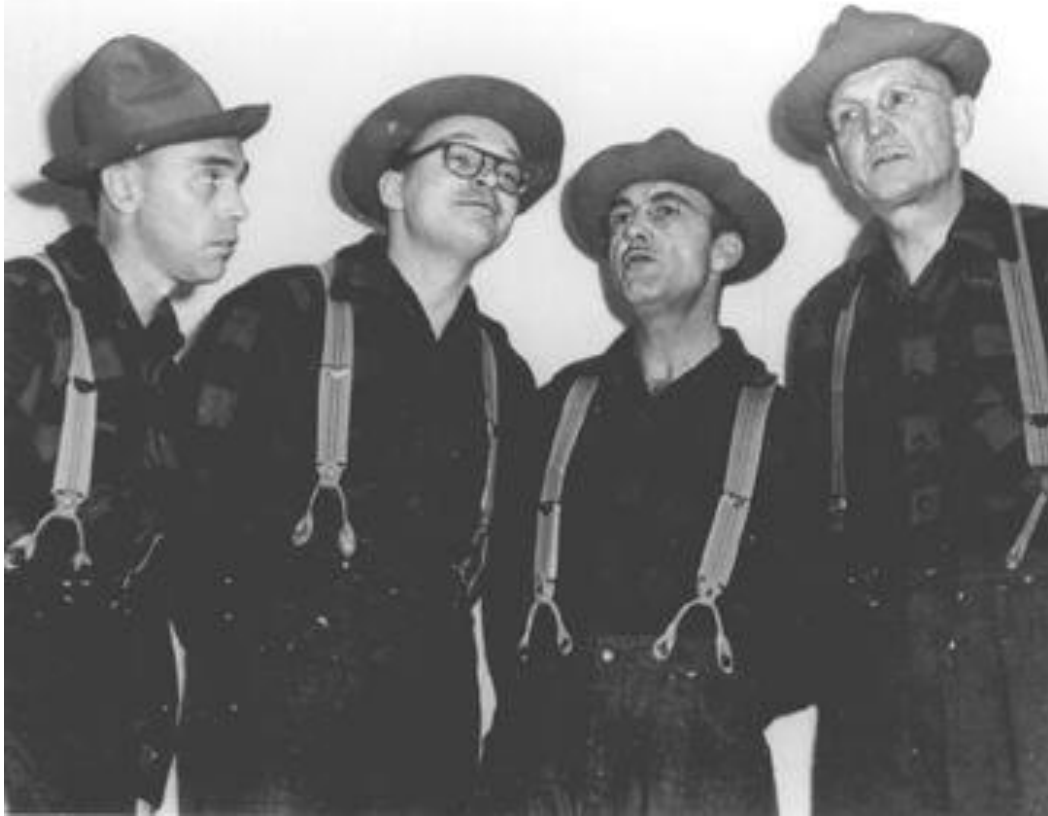
Lumber Lads 1950