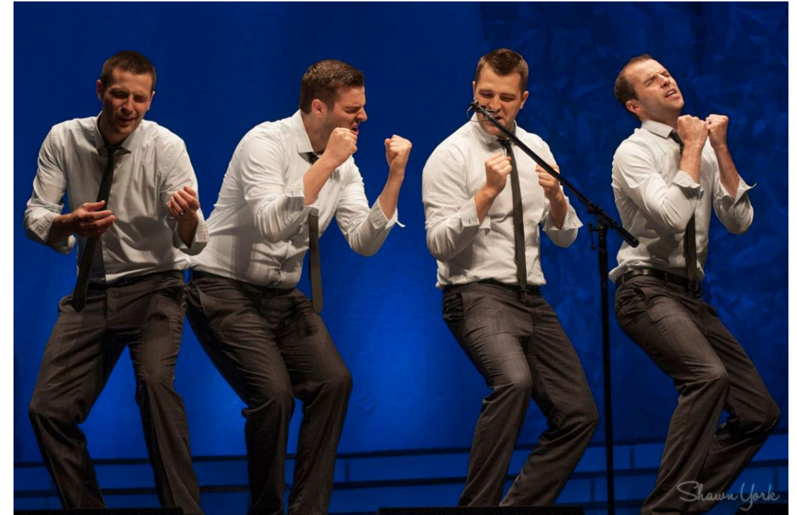
Momma's Boys 2018