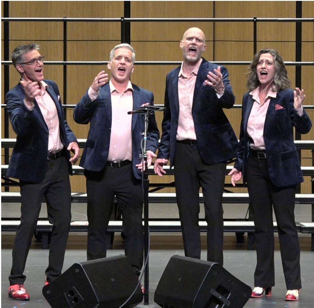
Metzin' Around 2023