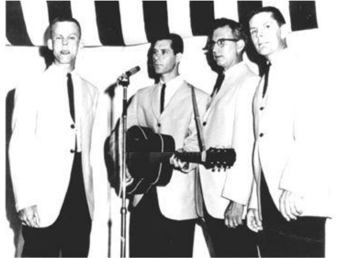
Four Do Matics 1957