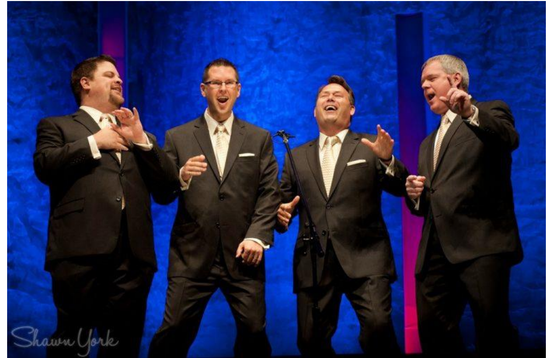
Madison Park 2014