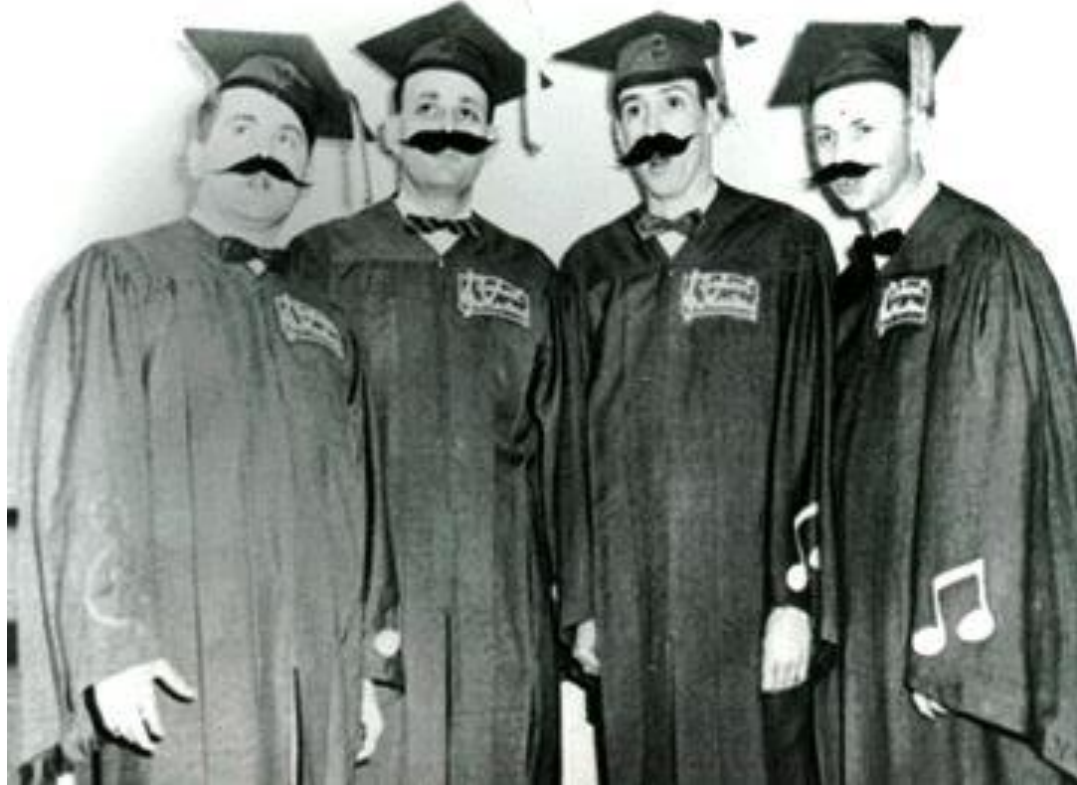
School Masters 1956