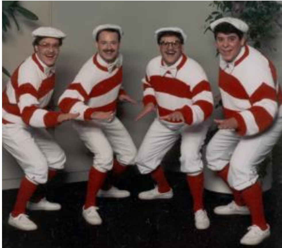
Four Cry'n Out Loud 1988