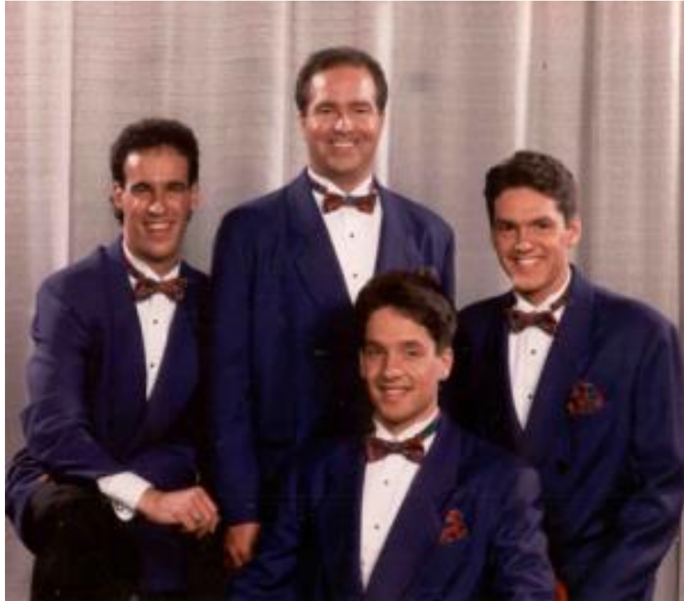
The Edge 1994