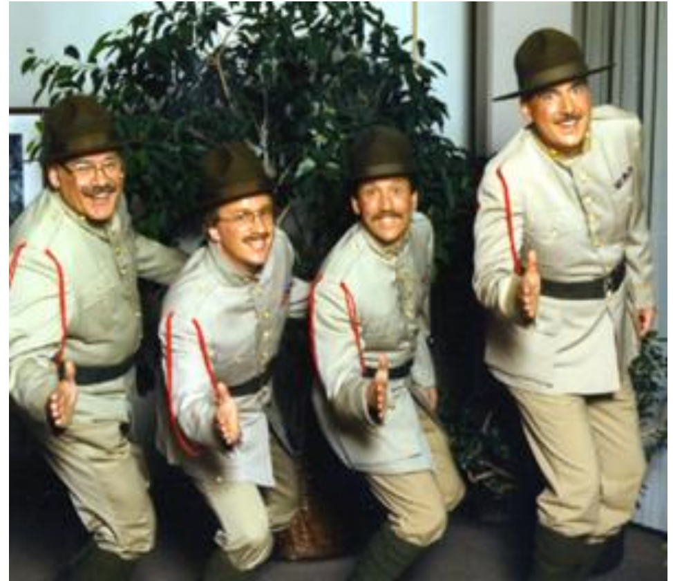
Easy Street 1987