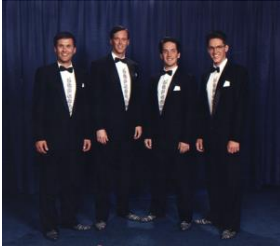
Sonic Boom 1990