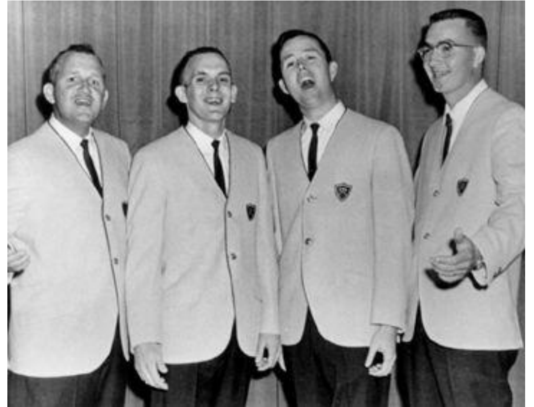
Bay Shore Four 1966