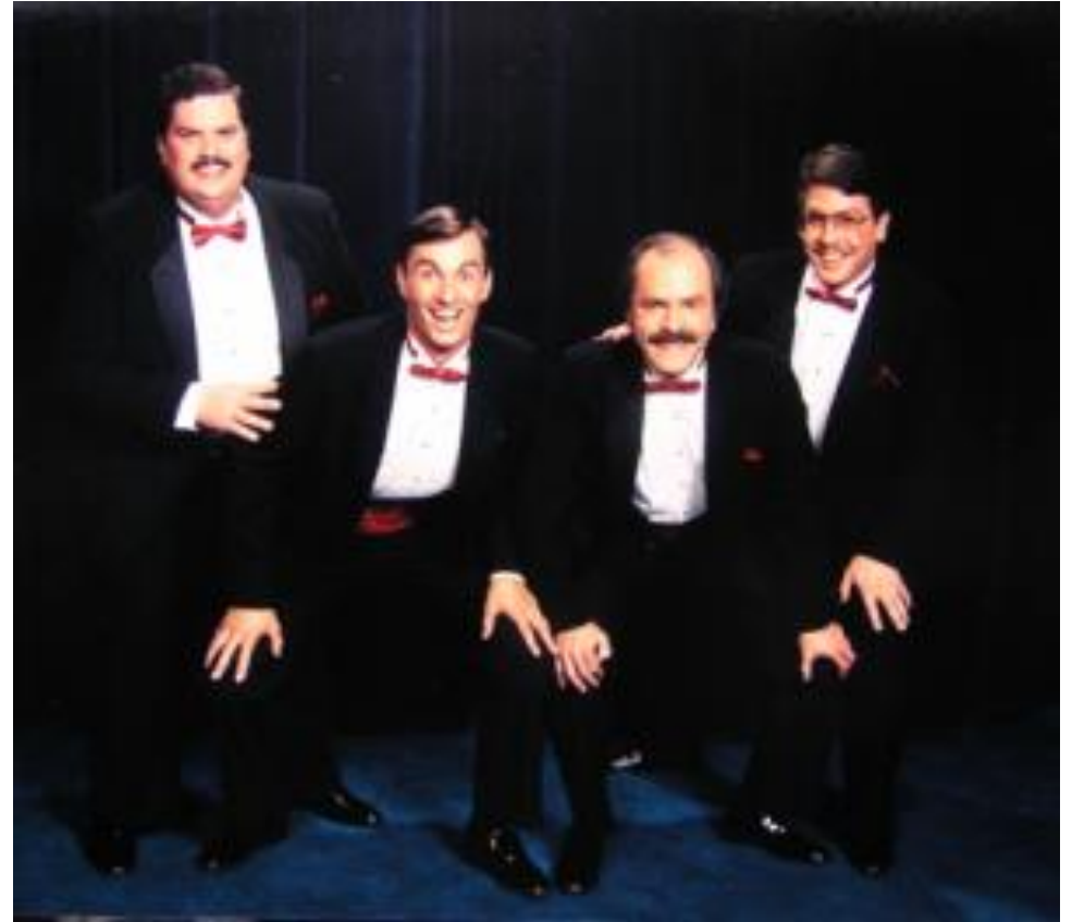
Vocal Attraction 1989