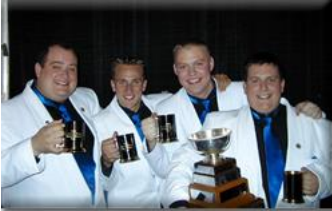
Sold Out 2000