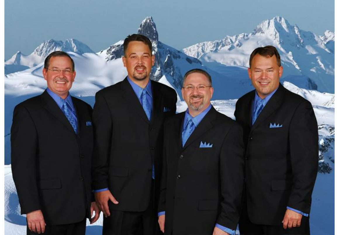
Fast Track 2009