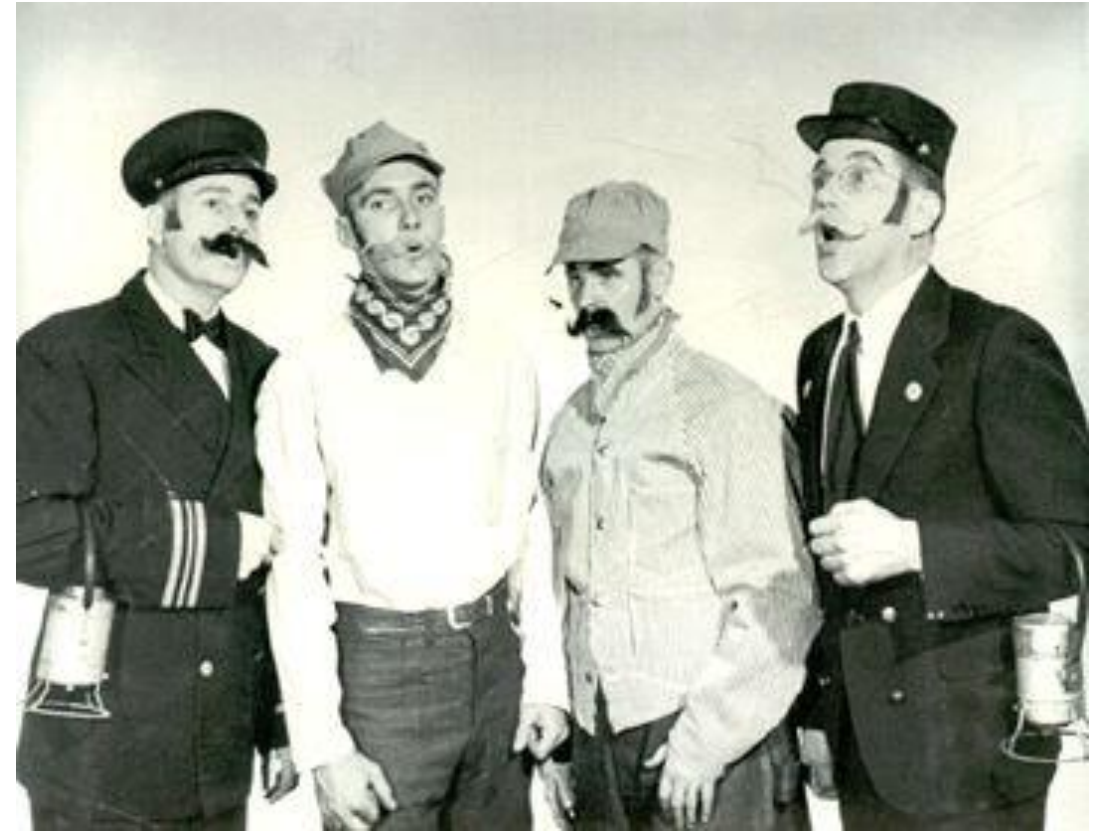
Puget Sounders 1951