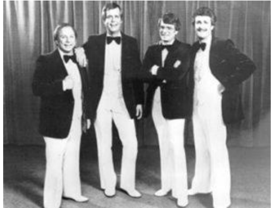
Pacific Pride 1983