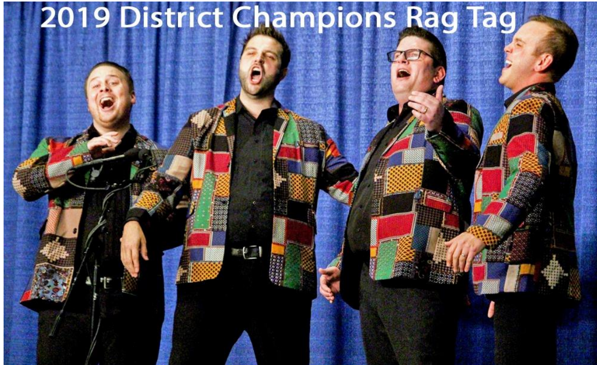
Rag Tag 2019