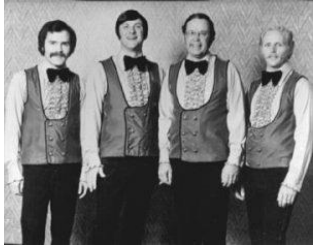
Lion's Share 1975