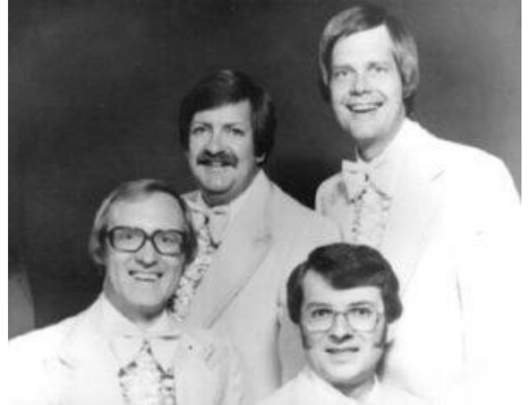
Four Cheers 1977