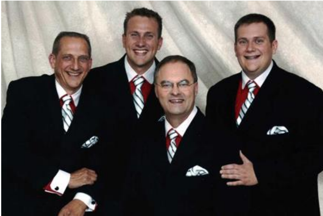
3 Outa Four 2008