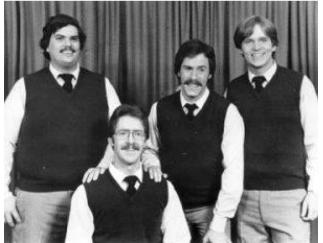
University Way 1979