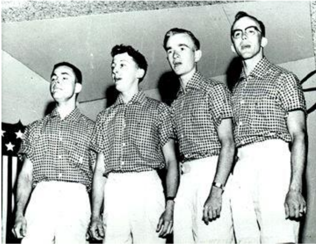
Sharp Four 1954