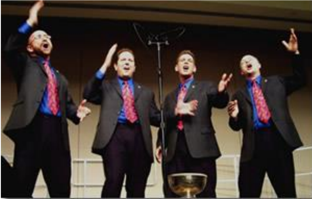
The Dean's List 2006