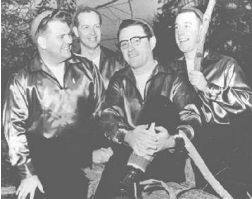
Timber Fellers 1958