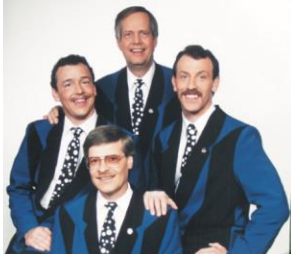
Hey Day 1991