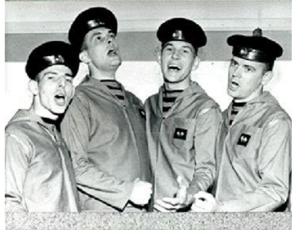
Sema Four 1959