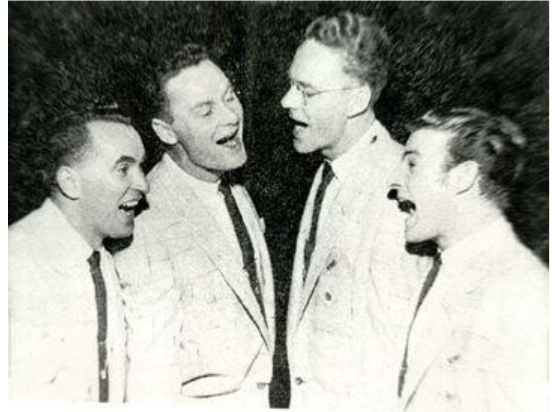
Model T Four 1955