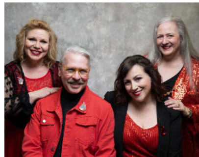
World Harmony Showcase