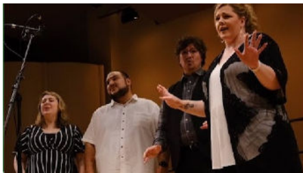
Mugshot - Chorus Festival - "Superior"