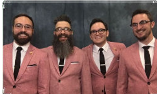
Argonauts: 36th 80.1 avg