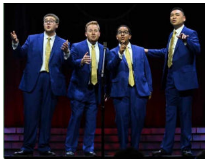
Side Hustle (FWD/EVG), Next Generation Varsity - 73.6 avg