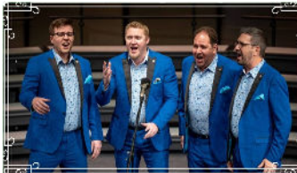
InVoice: 15th 83.1 avg