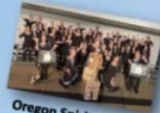
Oregon Spirit Chorus

Doors Open at 6:00 PM Admission only $10