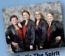
That's The Spirit

One Night Only May 20, 2023 8:30 PM Tickets only $10