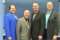
One Man Short