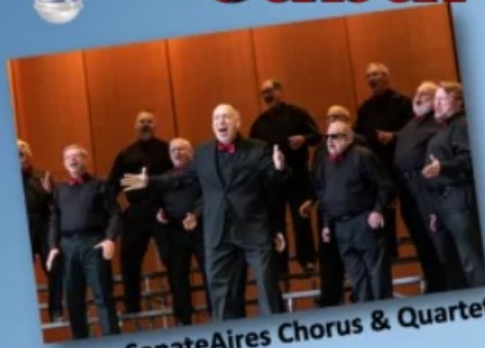
Oregon SenateAires Chorus & Quartets

One Night Only May 20, 2023 8:30 PM Tickets only $10