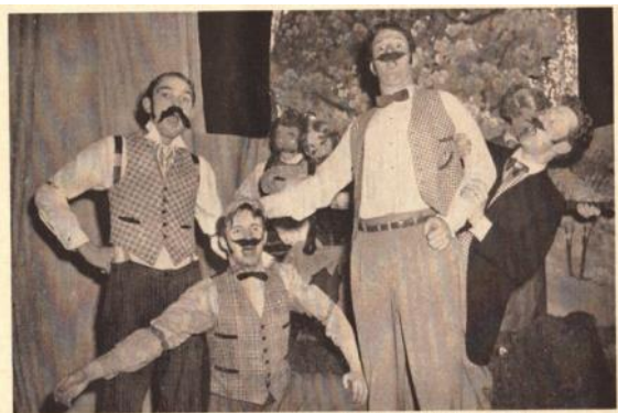
Agony Four, Oregon State College (2d place, 1949)