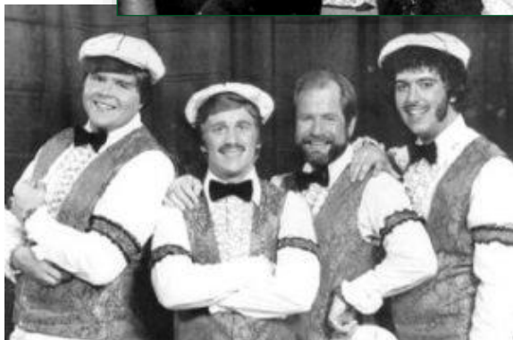
1980 South Sounders