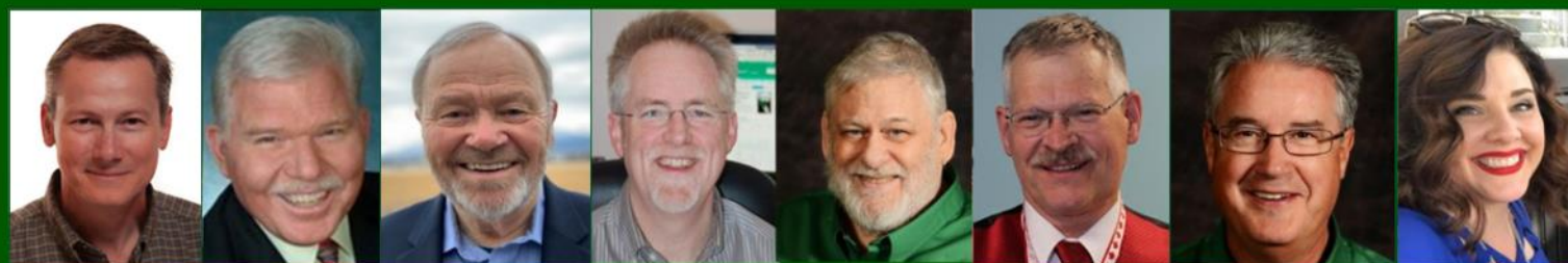
EVG 2022 Board - (left to right )