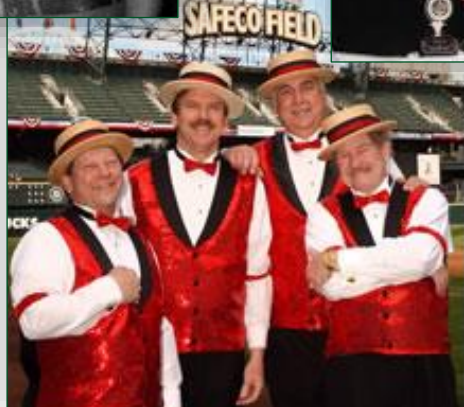
2007 Friendly Advice