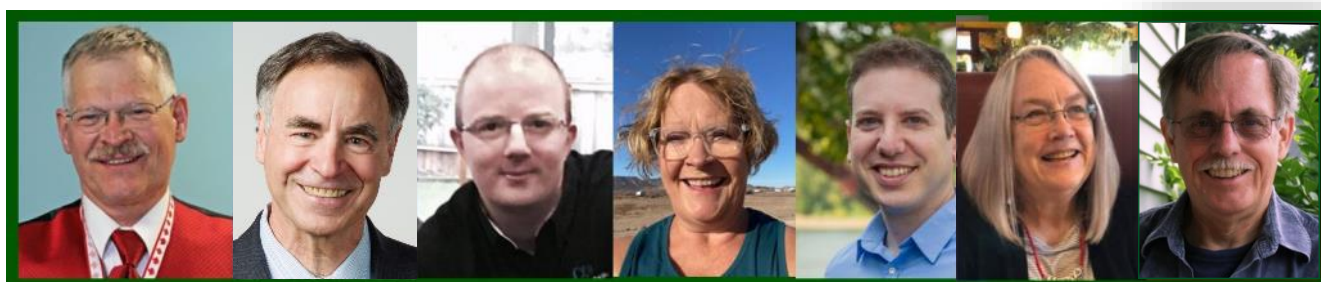
EVG Communications Team – (Left to right)