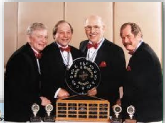
1996 Fatherly Advice