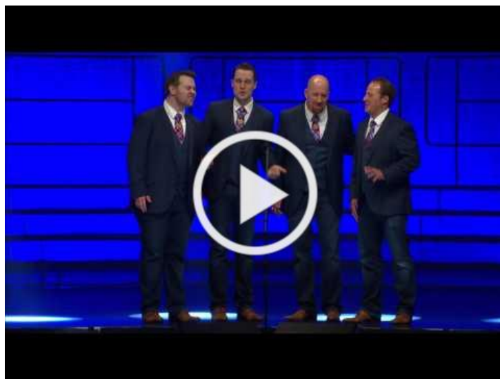
Lynden Music Festival