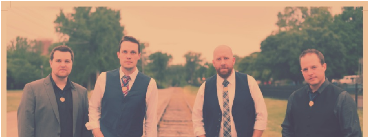
Vocal Spectrum 2006 International Quartet Champions